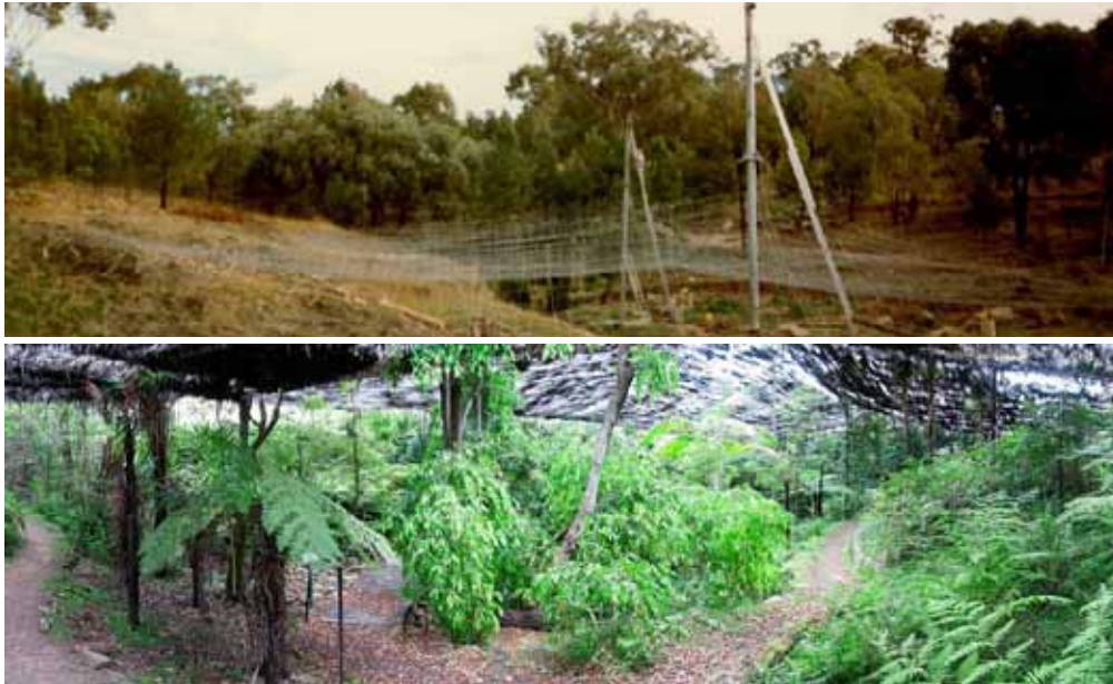
Rainforest gully under construction and as it is today.