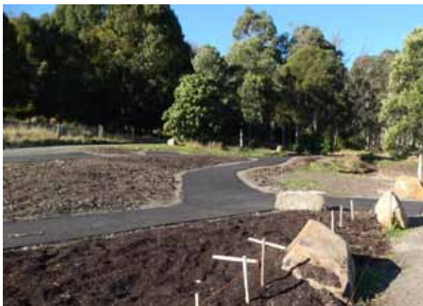
New Sensory Garden ready for planting