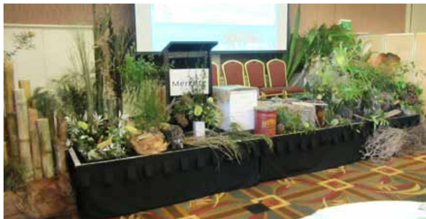
'The superbly created regional floral display' on the main stage.

Preparation for the Conference started more than two years ago when, in Port Augusta, Friends of Gold Coast RBG 'put their hand up' to host the next biennial AFBG Conference. We looked upon the hosting as a great opportunity to attract Friends of Botanic Gardens from around Australia to Queensland for the first time and to showcase what has been achieved in the now eleven years since the first Community Planting Day at our Gardens in 2003. We also wanted to show that the Gold Coast does have a 'green heart' in the midst of all the glittering gold!