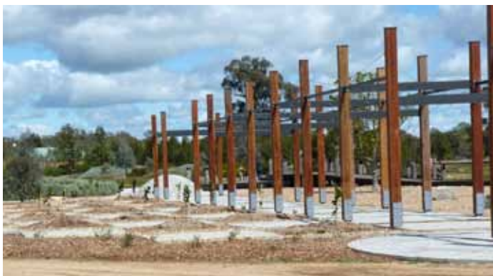
Photos from the top: Lake, island and boardwalk. Photo by Bev Rankin; Stage One Photo by Nancye Smith; Stage Two ready for opening, Photo by Bev Rankin.

The first structure, completed in 2007, was the Nestle boardwalk. The boardwalk fringes a small lake with Melaleuca Island its centre piece. Stage One, a formal garden, was opened on 11 November 2011 by the Hon Sussan Ley MP, Member for Farrer. It includes signature Brachychiton trees, a rain garden, rock seating walls, indigenous plantings, gravel pathways and lawn areas.