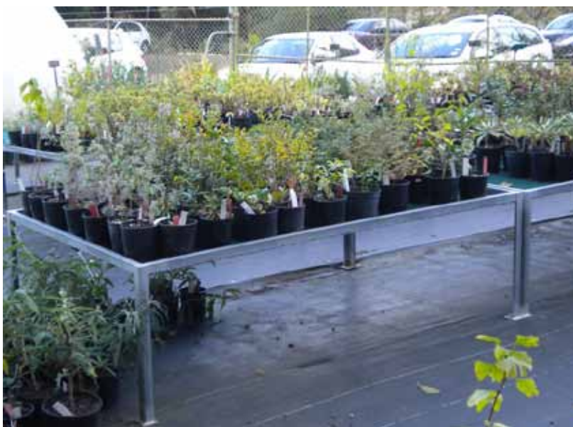
Nursery Tables: FGBG Friends' Nursery