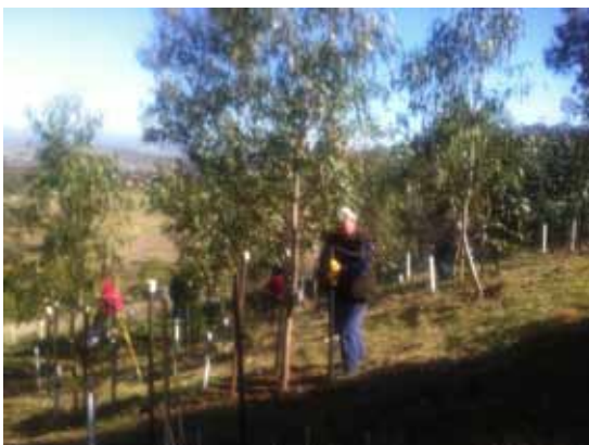
Removing guards from threatened species at Spring working bee

We held our Annual General Meeting in August and were barely able to elect a functioning committee, finishing with only enough committee members for a quorum. We seem unable to generate any interest from the existing membership base in the future management of the group. It was very difficult to fill the position of secretary until an existing committee member kindly agreed to take it on. Dwindling membership is our main problem. But 2014 has been a successful year in terms of our supporting role in the development of the Garden.