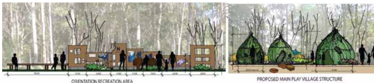
Drawing published with permission from Sunshine Coast Council and Delve Consulting

Friends of Maroochy Regional Bushland Botanic Gardens Buderim, Queensland