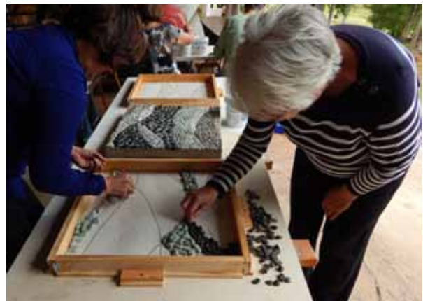
Working on mosaic path pavers.