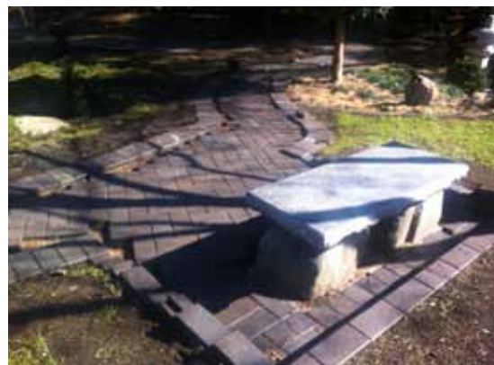
Laying pavers in Asian Conifer Garden