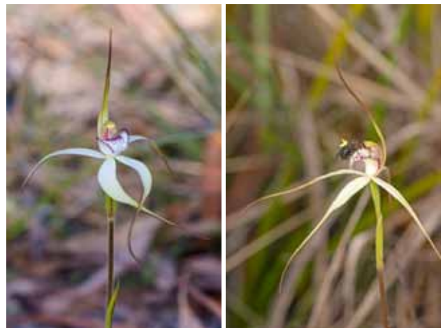
Caladenia saggoccola ; and with a deceived insect.

Orchids attract their pollinators by different means: (this is the sex bit!)