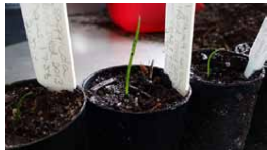
Orchids now growing up in pots