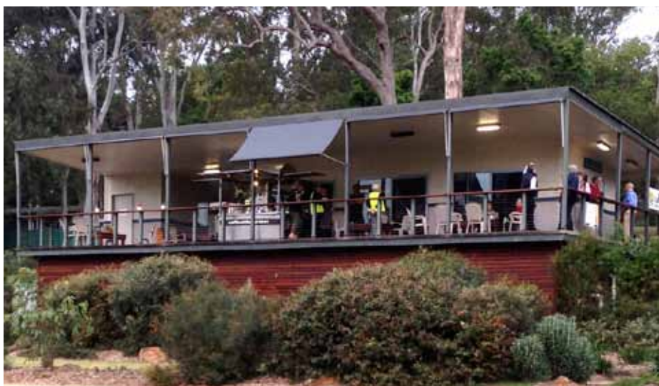
Gold Coast Regional Botanic Gardens Friends Centre

The Memorandum of Understanding now established between the AFBG and BGANZ acknowledges the contribution that Friends make towards botanic gardens and in the future this partnership will strengthen Friends' role in the continued development of botanic gardens around Australia. The visit to the Gold Coast RBG was well received with seven groups being guided around the different precincts of our Gardens. The only complaint was that there wasn't enough time to further explore!