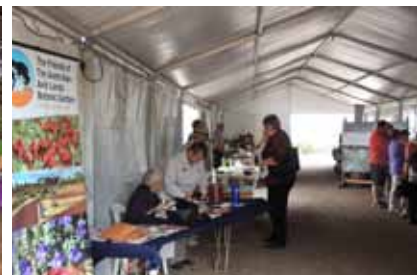
Matthew Flinders exhibition; Wattle walk; Displays tent at Garden Expo with Friends signing up new members and cooking a bbq.