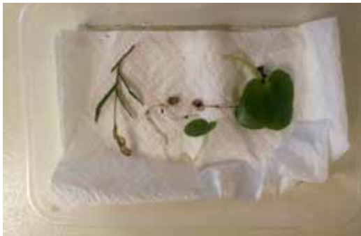
Pterostylis melagramma , a greenhood orchid, separated into its above ground and below ground parts.