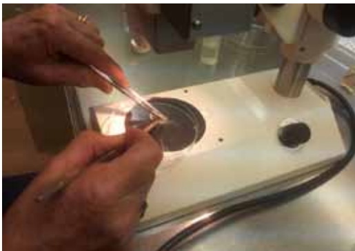
The mycorrhizal fungi is plated onto a nutrient agar petri dish to grow.