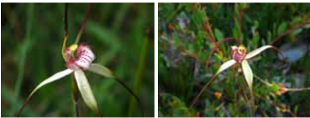
Caladenia anthracina Black-tipped Spider Orchid; Caladenia dienema Windswept Spider Orchid.

Tasmania has over 200 orchid species, many of which are endemic and highly threatened. Over one third of Tasmania's orchids are threatened with extinction and many others are naturally rare, only known from a small number of populations. Threats include climate change, competition from invasive weeds, land clearing for agriculture and urbanisation. There is an urgent need to undertake conservation research to learn more about why these species are rare and how best to preserve them.